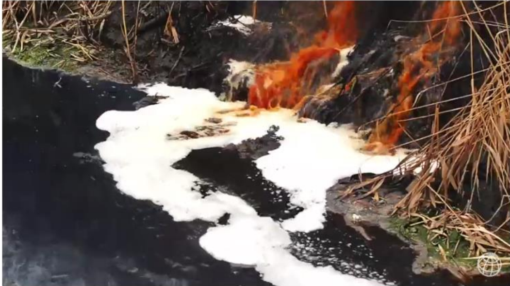
World Bank Group